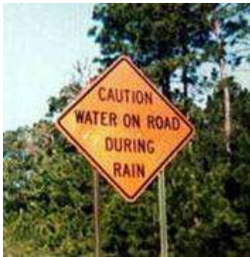
A fine example of rocket science