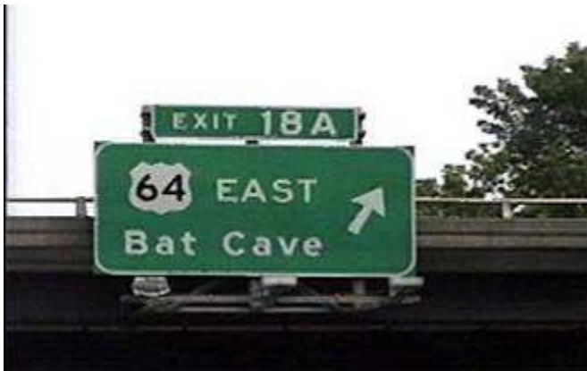
Just in case Batman forgets?