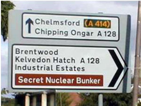
Oops, not secret anymore!!