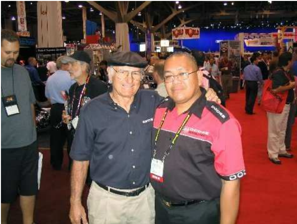
Mopar & drag racing legend, Don Garlits!